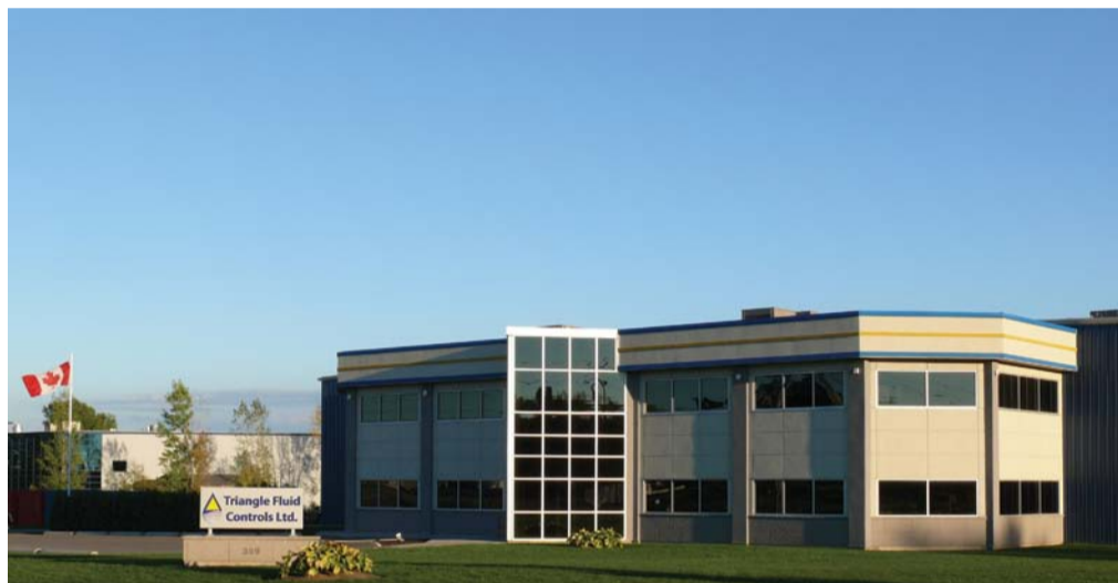
Triangle Fluid Controls - Belleville, Ontario, Canada

Triangle Fluid Controls Ltd. was established in December of 2007 through a corporate spin-off from gasket manufacturer, Durabla Canada. The Durabla brand, established globally in 1912 and in Canada in 1922, initially gained popularity for its offering of premium-grade asbestos fiber sheet material, eventually migrating to non-asbestos products in the 1980s. While the manufacture of asbestos products was completely phased out in the early 2010s, Durabla Canada remains a distinguished manufacturer of compressed non-asbestos gasketing and some molded fluoroelastomer products for the North American and Asian markets.