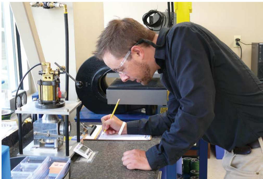
Triangle Fluid lab testing