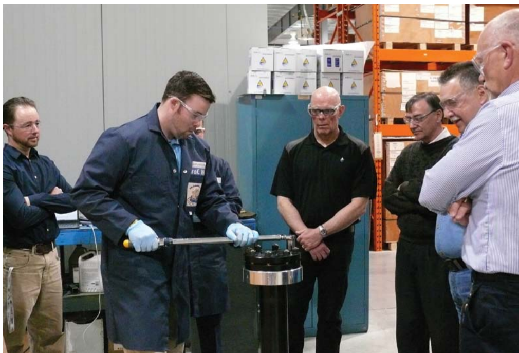
Triangle Fluid gasket training rig

to Triangle Fluid, called Gasket Resources Inc., headquartered in Downingtown, Pennsylvania, is the master sales, marketing and manufacturer of Durlon® Sealing Products in the United States. Technical Services for Gasket Resources is located in Houston, Texas, which provides technical support to end users and plant personnel. Along with their established US distribution network, they have serviced their clients with Durlon® gasket products since 2002.